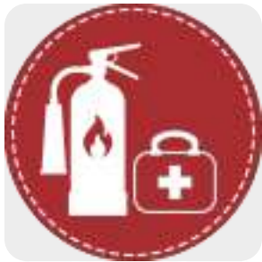
First Aid & FE Kit