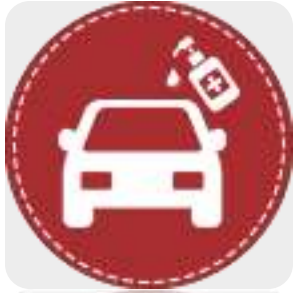
Fully Sanitized Cabs