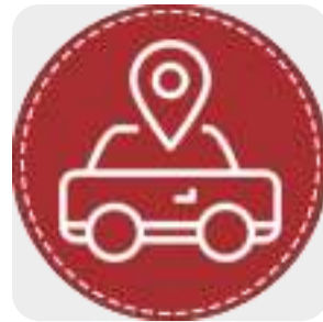
GPS Enabled Cabs